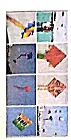
In State, Makar Sankranti is celebrated on 13th, 14th & 15th January when people fly colorful kites. Each state's kite is different.