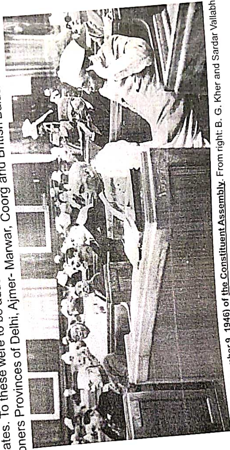
First day (December 9, 1946) of the Constituent Assembly . From right: B. G. Kher and Sardar Vallabhai Patel; K. M. Munshi is seated behind Patel.

The Constituent Assembly consisted of 385 members, of which 292 were elected by the elected members of the Provincial Legislative Assemblies while 93 members were nominated by the Princely States. To these were to be added a representative each from the four Chief Commissioners Provinces of Delhi, Ajmer- Marwar, Coorg and British Baluchistan.