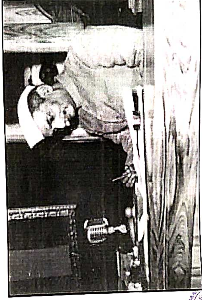
Dr. Rajendra Prasad signing the new constitution

In the light of these 'Objectives' the Assembly completed its task by November 26, 1949. The constitution was enforced with effect from January 26, 1950. From that day India became Republic of India.